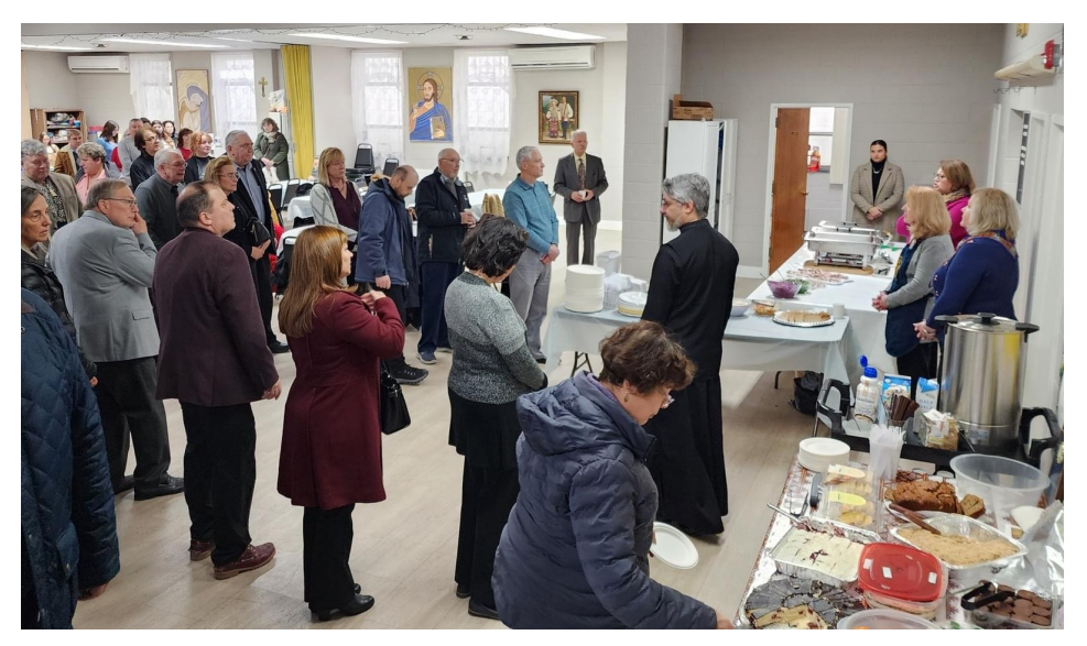
St. Sophia Seminary UOL Chapter Support Souper Bowl Sunday

Every year the St. Vladimir Junior UOL organizes Souper Bowl Sunday. Our Juniors and their families prepare soup for Sunday. Multiple wonderful soups were prepared for the day.